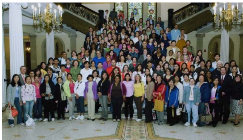
Lowell ABE Students Visit the State House